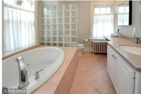
View from the shower of Master Bath