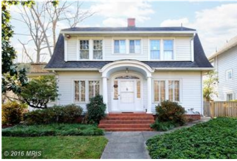
Martha Washington Model Sears Kit House