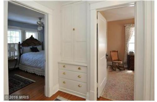
Upper level hall linen closet