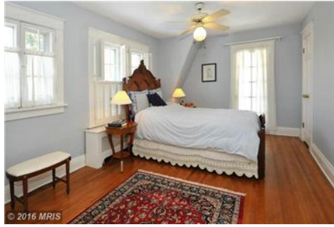
Bed area of Master Bedroom