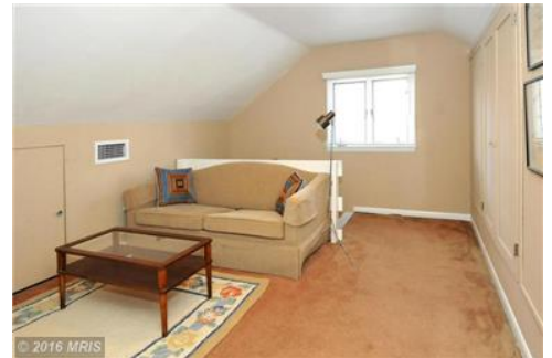
Bedroom #4 Sitting Area