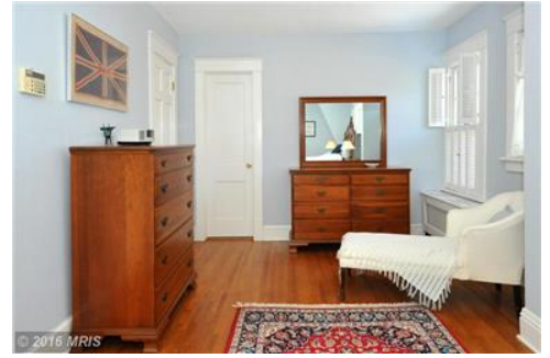
Sitting area of Master Bedroom