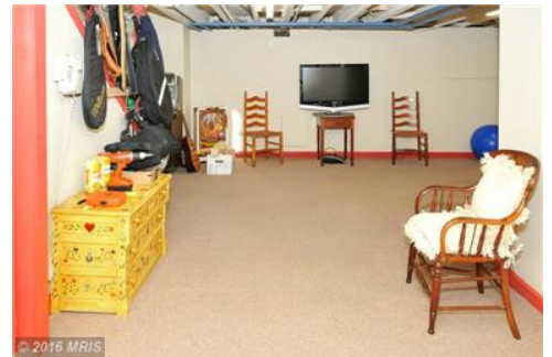
Recreation Room View 2

Listing provided by: Evers & Company Real Estate, Inc.