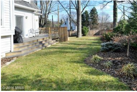
View of deck and yard