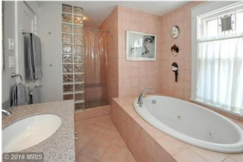
View of tub and separate shower in Master Bath