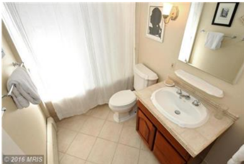
Second Floor Hall Bath